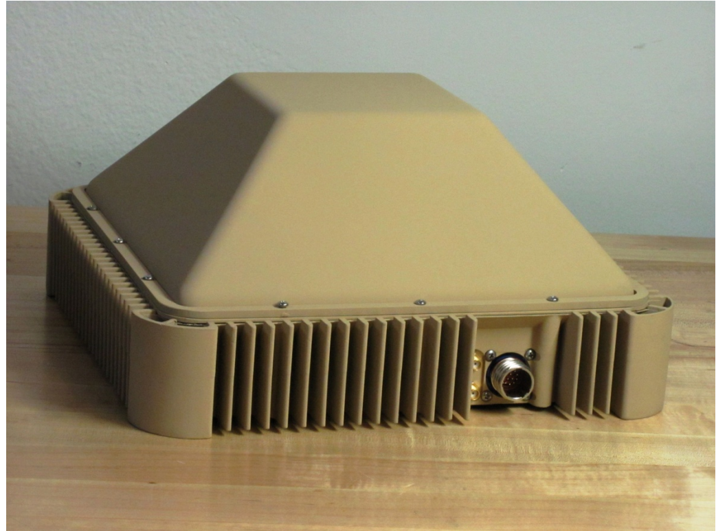
SAXBA dimensions: 10.75"x10.75"Base x 5.5" H